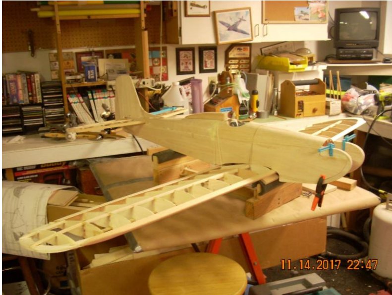
Chick Fosters Hog