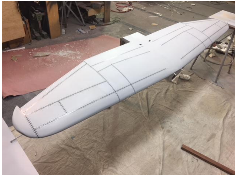
P-47 Wing, Rivets and Panel Lines Ready to Prime