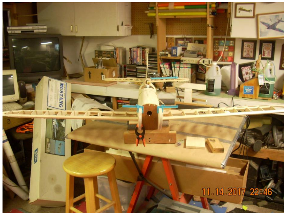
Chick Fosters HOG