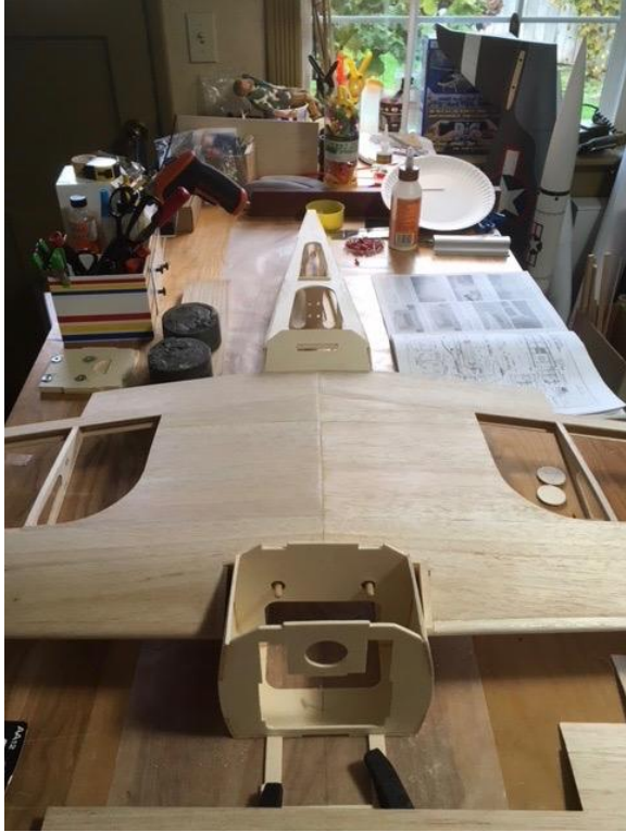
Jeff Lutz's Extra 300