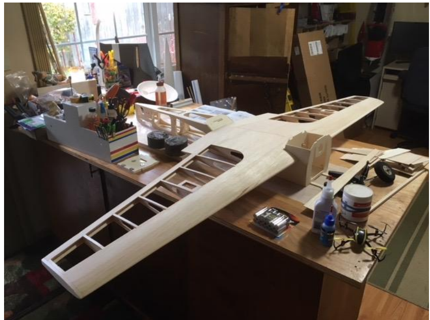
Jeff Lutz's Extra 300