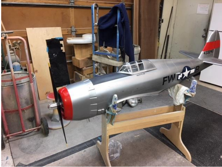
Franks P-47 Fuselage Painted